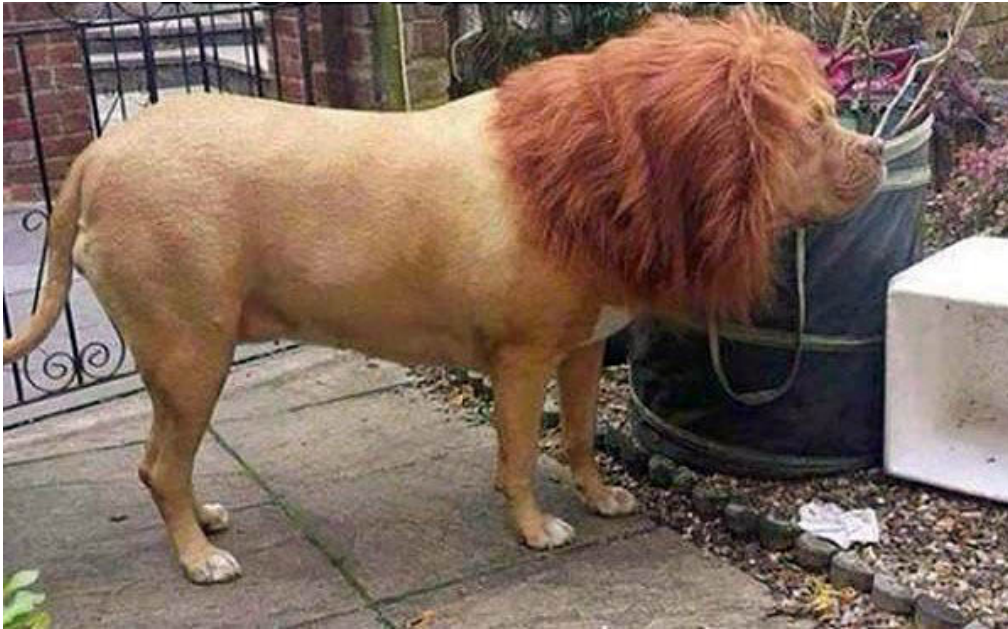
180 pound Great Dane from the Shelter $100, Wig from Ebay $15. The look on the neighbors face PRICELESS