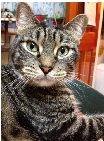
And here is his photo